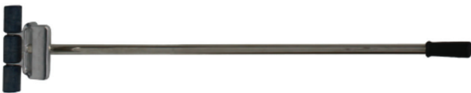
EPOR REEFER REPAIR ROLLER