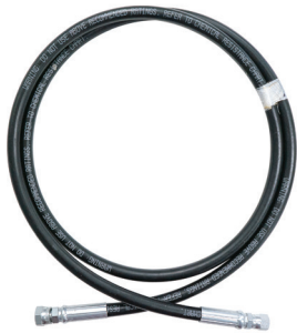
M130-6 BLACK HOSE