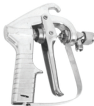
M120 SPRAY GUN