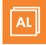
Metal / Aluminum Sheetting