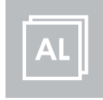
Metal / Aluminum Sheeting